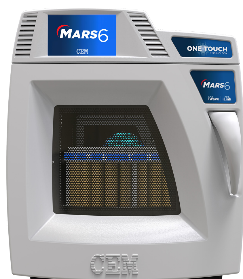
Figure 2. MARS 6 with iWave temperature sensor.