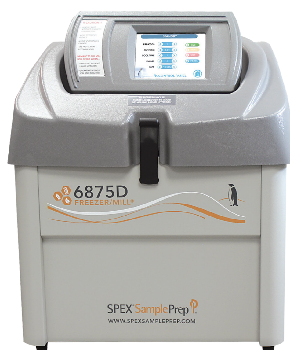
Figure 1. SPEX SamplePrep Freezer/Mill®